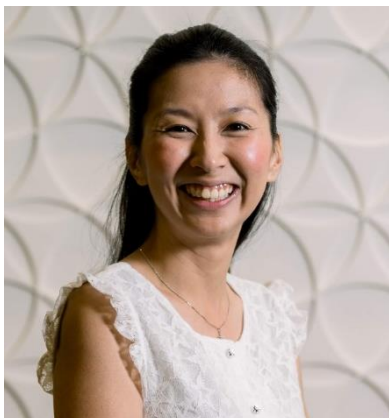
Tan See Leng Executive Director Heartware Network