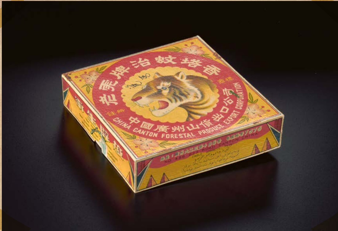
Mosquito Coil Box Packaging, mid-20th century