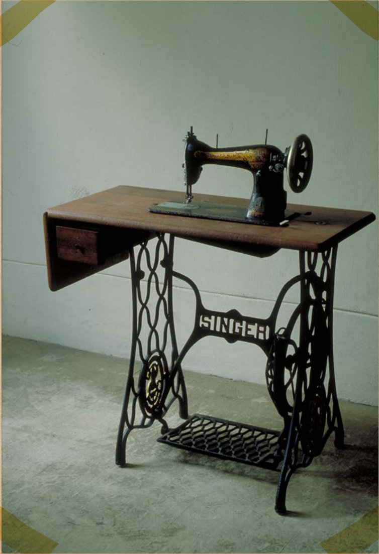
Singer Sewing Machine, 1930s-1940s