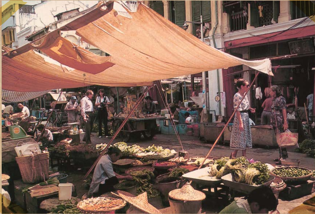
View of Street Market at Chinatown, 1960-1990