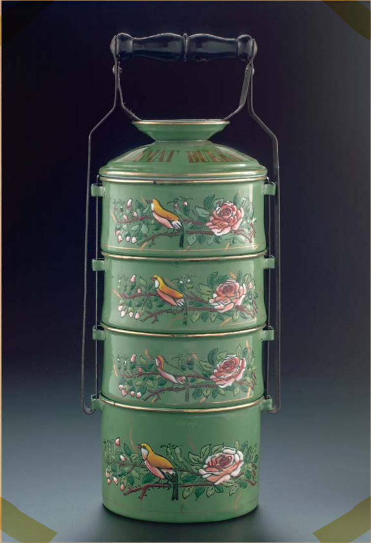
Tiffin Carrier, early mid-20th century