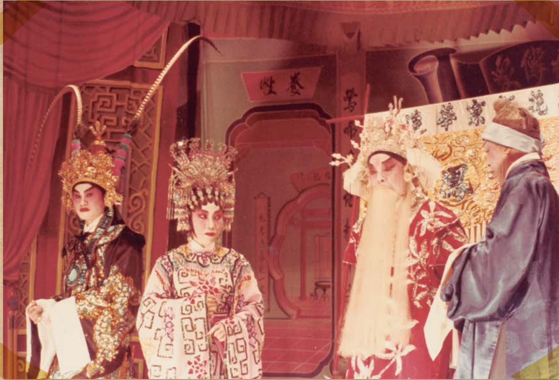
Chinese Opera Performance, 1970s-1980s