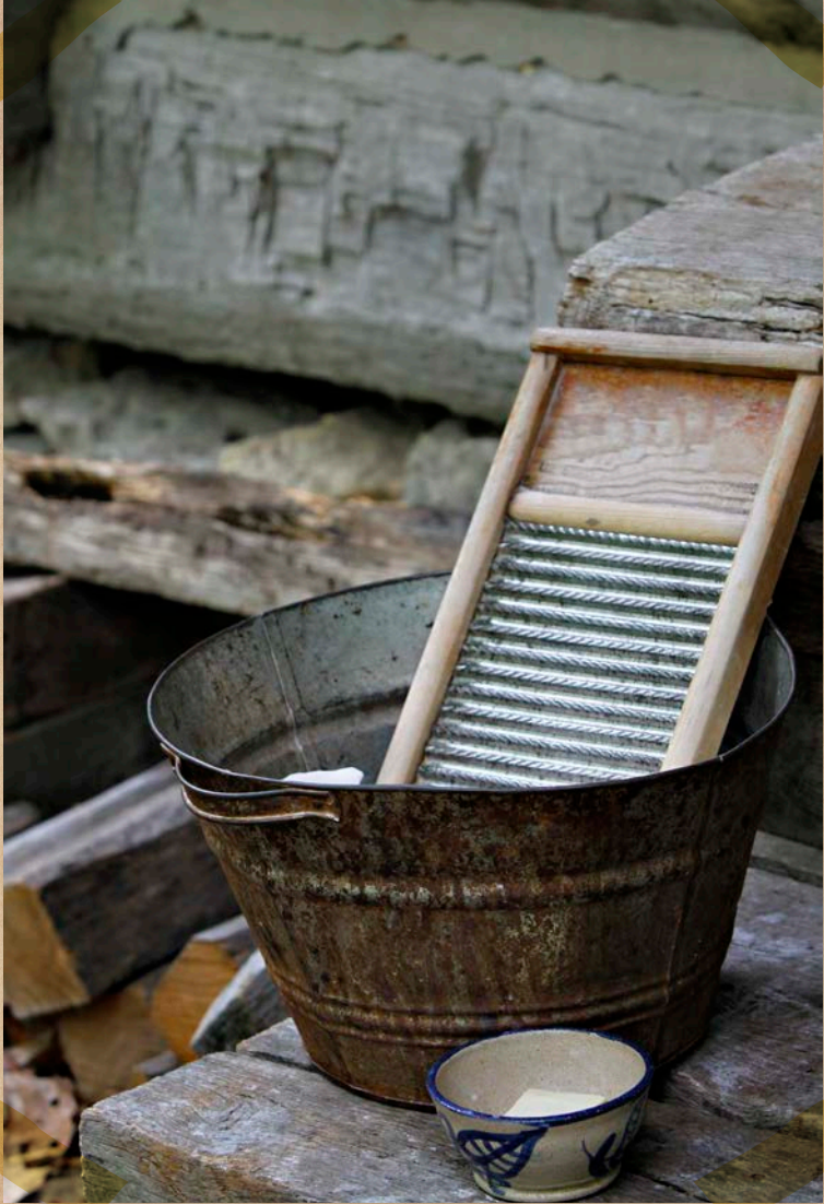
Washing Board 洗衣板