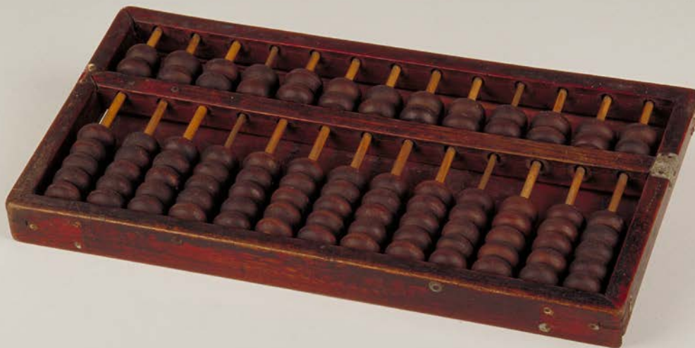
Timber Abacus, 20th century