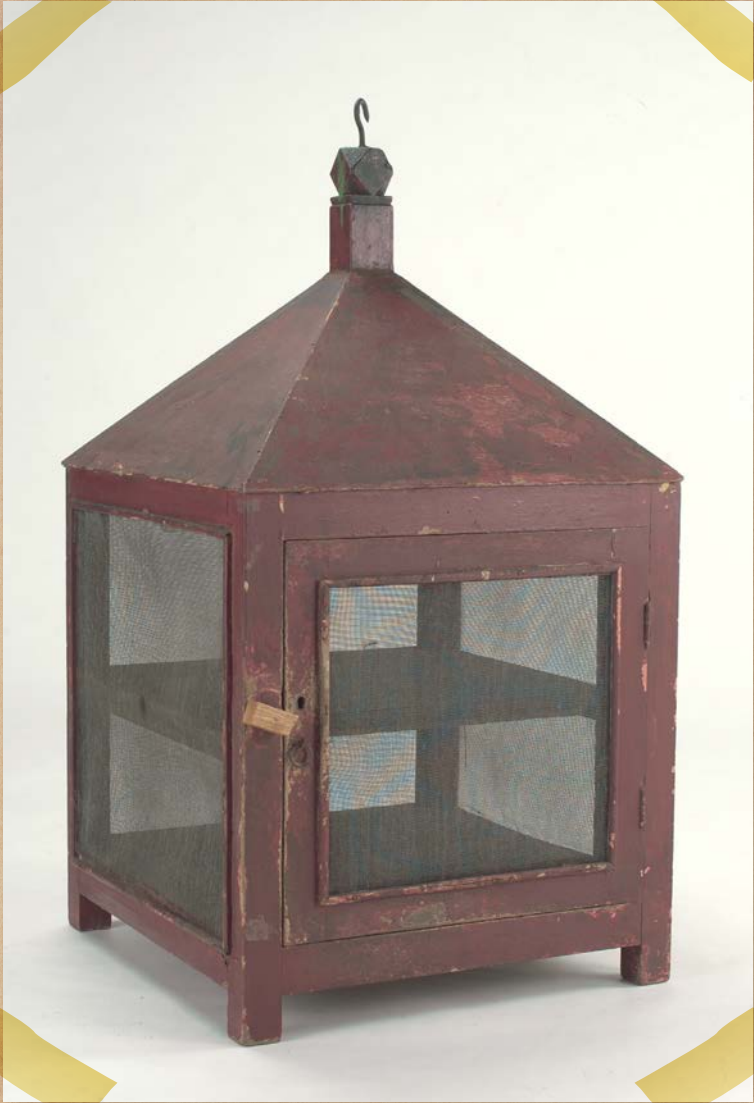
Meat Safe, 1940s-1970s