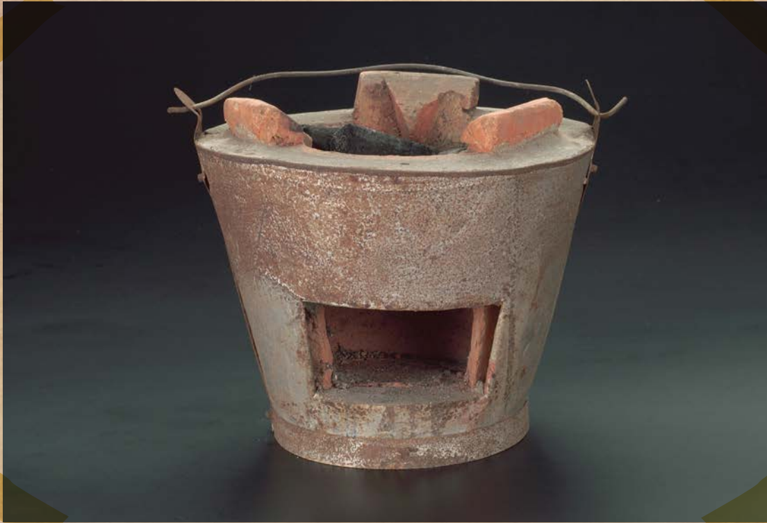
Charcoal Stove, 1960s