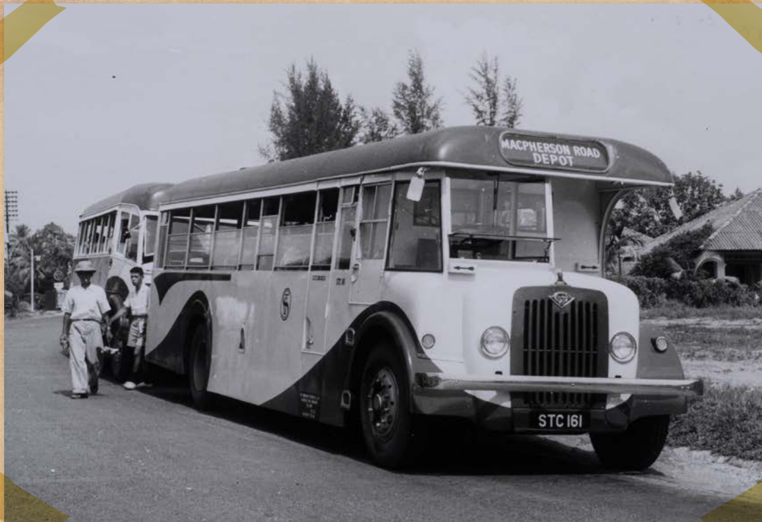
Singapore Traction Company Bus, 1960s