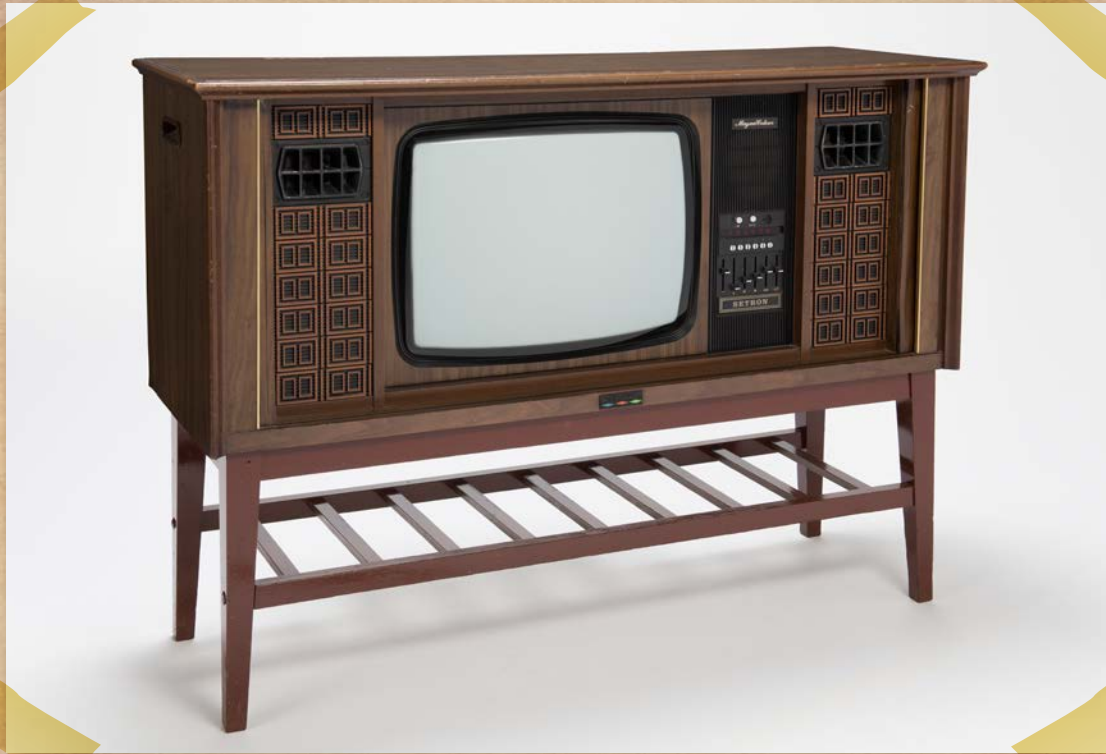
Setron Television Set, 1960s-1970s