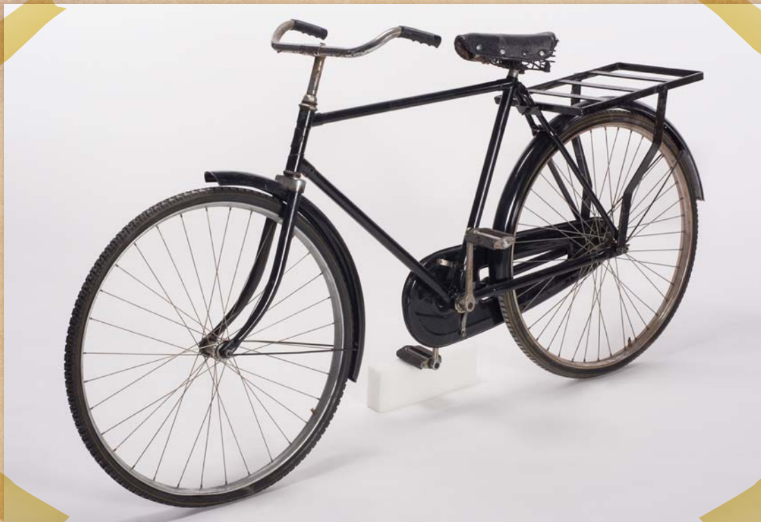
Men's Vintage Bicycle, 1940s