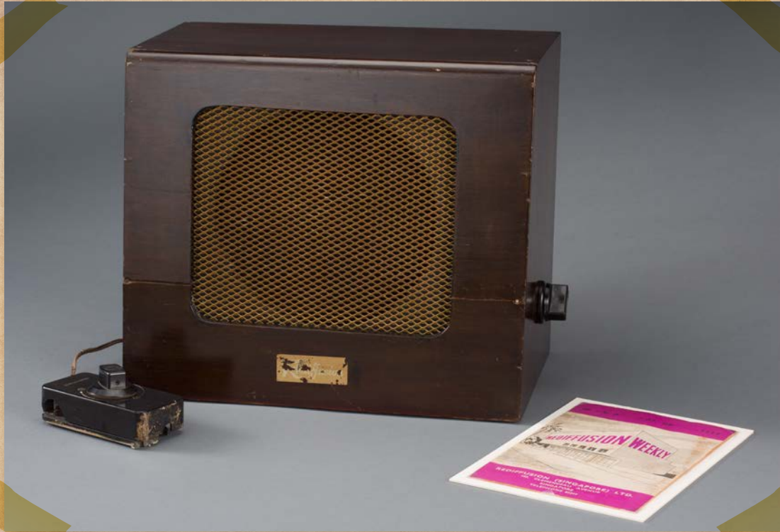
Rediffusion set, 1950s