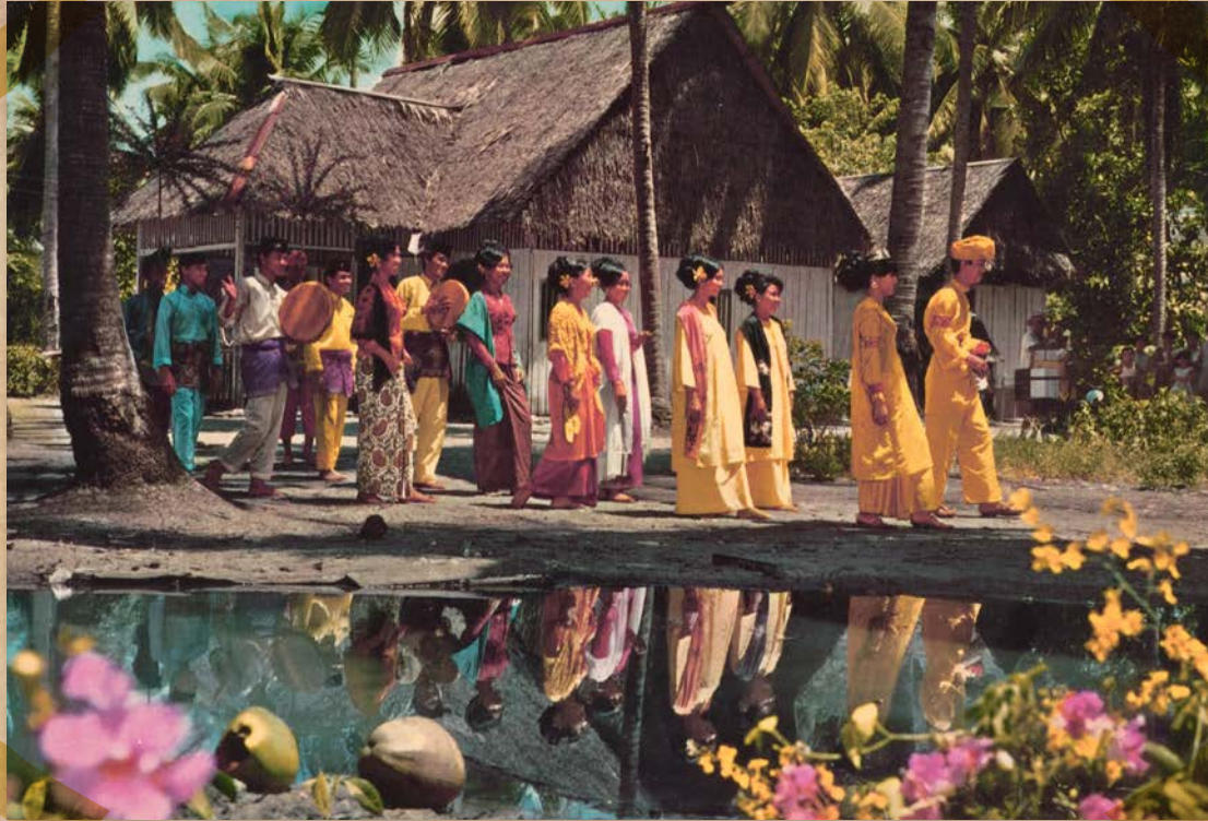
A Malay Wedding Procession at a Kampong, c.1970s