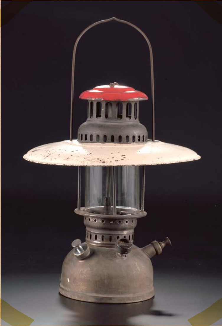
Pressure Lamp, 1960s