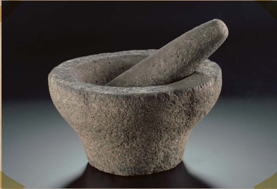
Granite Mortar and Pestle, 1960s